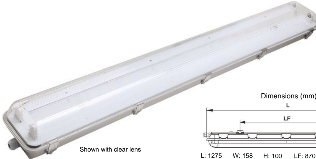
Shown with clear lens

Project Reference: _____ Fixture Type: _____ Cat. No.: _____ Voltage: _____ Options: _____