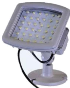
Adjustable wall or ceiling mount