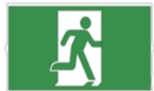
1 pc. without arrow